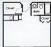
Studio Efficiency Apartment 366 sq. ft.