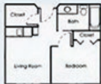
One Bedroom Apartment 428 sq. ft.